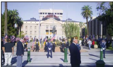
On Aug. 4, Governor Brewer signed into law that the POW/MIA Flag be flown at all city & state buildings in Arizona. Pictured are VFW members awaiting the flag-raising ceremony at the Capitol to recognize the law and honor the soldiers it represents.